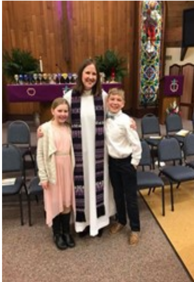
Twenty one young people received First Communion during Holy Week!